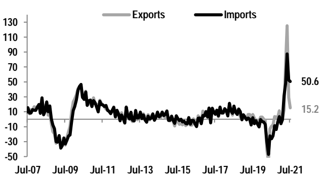
Chart 1: Exports and imports % y/y nsa